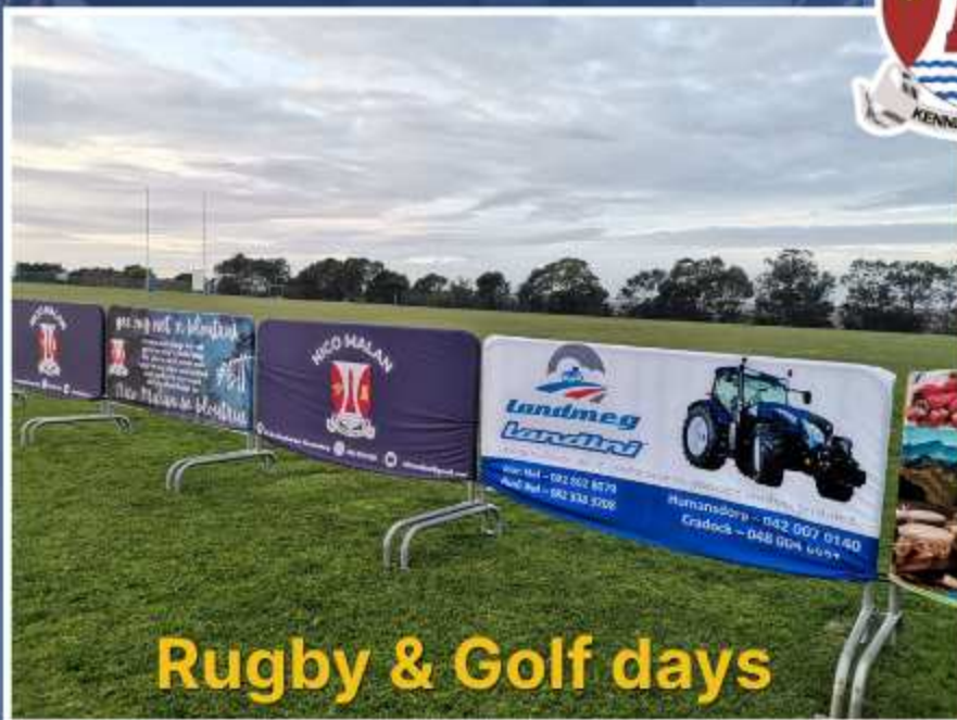
Rugby & Golf days